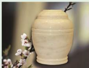
NV Elegant Urn 安祥骨灰甕