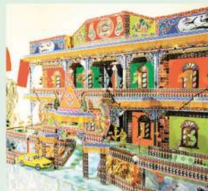
Handcrafted Paper Model 精工制作紙扎