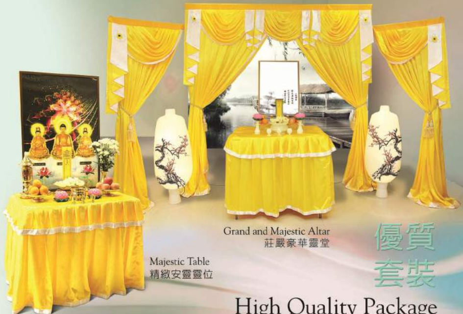
Grand and Majestic Altar 莊嚴豪華靈堂