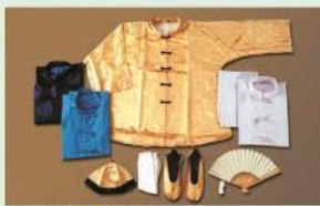
Imported Longevity Costume 進口優質入殮用品