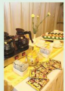
Light Refreshment 備辦輕便茶點