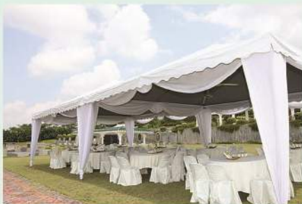
Well-appointed Canopy 精緻設計的特色大帳