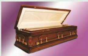
NV Elegant Casket 安祥壽木