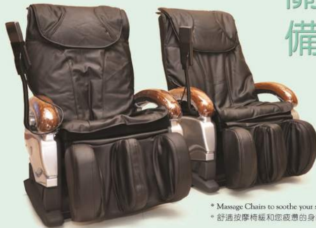
* Massage Chairs to soothe your sorrow * 舒適按摩椅緩和您疲憊的身軀及悲慟的心情

*Available at Nirvana Memorial Center (KL) only. 只限於吉隆坡富貴紀念館。