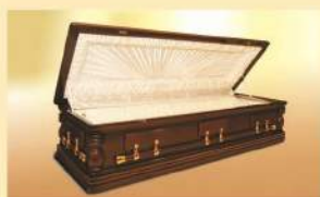
NV Honour Casket 如意壽木