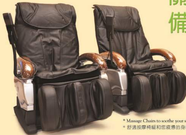
* Massage Chairs to soothe your sorrow * 舒適按摩椅緩和您疲憊的身軀及悲傷的心情