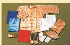
Imported Longevity Costume 進口優質入殮用品