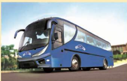
Luxurious Air-Conditioned Bus 出殯豪華冷氣巴士