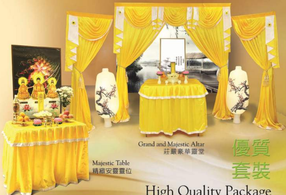
Grand and Majestic Altar 莊嚴豪華靈堂