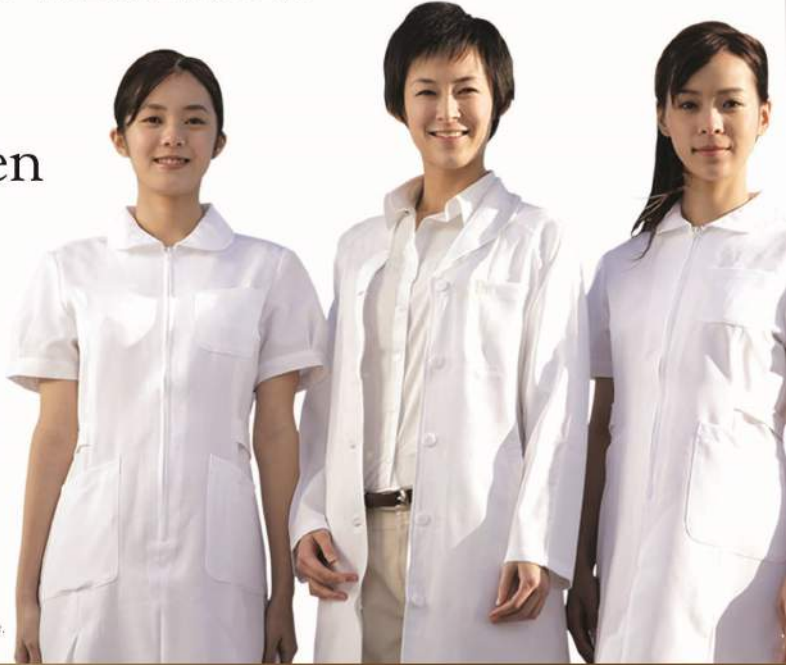
White Ladies service is available within Klang Valley only. 白衣天使服務只限於巴生谷地區。

The White Ladies are a team of professionally trained female embalmers and beauticians dedicated to rendering their immaculate services with a genuine heart for deceased female body. This will leave a comforting imprint on the spouse, parents and children who would feel more at ease with this service respect for their departed loved ones.