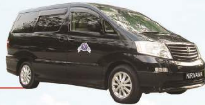
Luxurious Limousine 豪華高貴禮車

死亡是生命中有難以承受之「痛」，當生命落幕的當下，人們難免感傷；就讓我們陪您渡過煎熬、為生命的消逝找到悲傷的出口，為往生者策劃出一個完美的人生旅程。