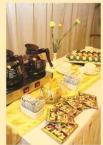
Light Refreshment 備辦輕便茶點