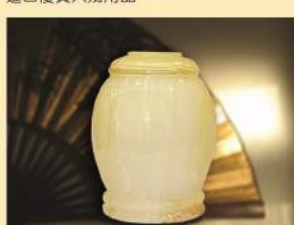
NV Honour Urn 如意骨灰甕