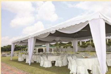
Well-appointed Canopy 精緻設計的特色大棚