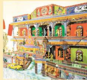
Handcrafted Paper Model 精工制作紙扎